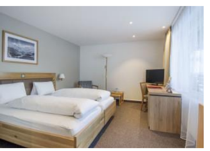
Nova double room