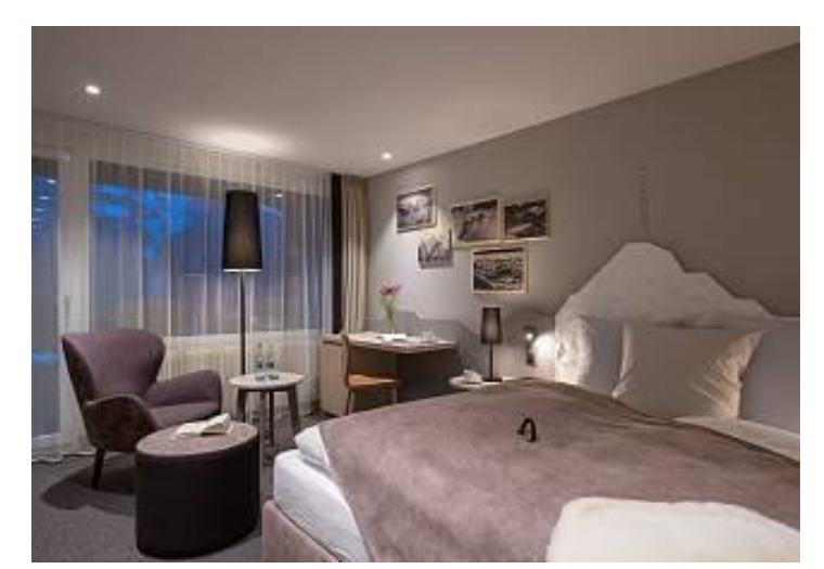
Premium double room