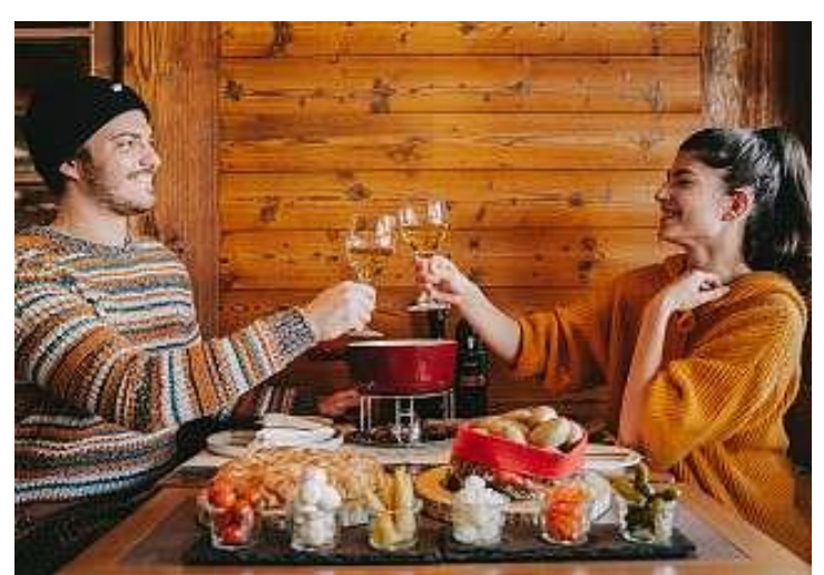
Breakfast Dinner «Adlerstube»