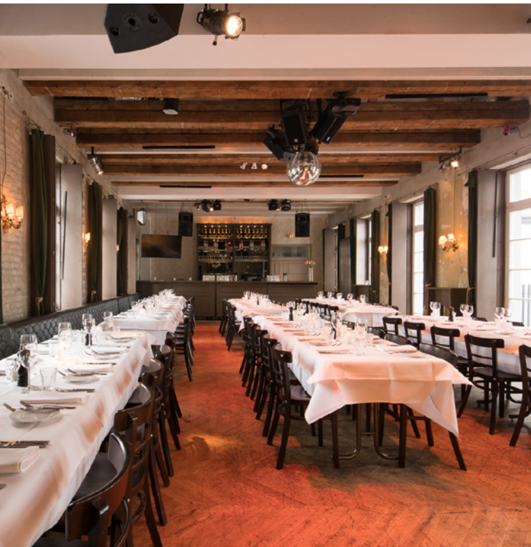
Ballroom - Dinner