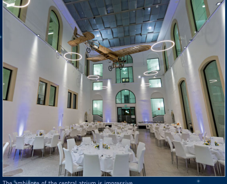
The ambience of the central atrium is impressive