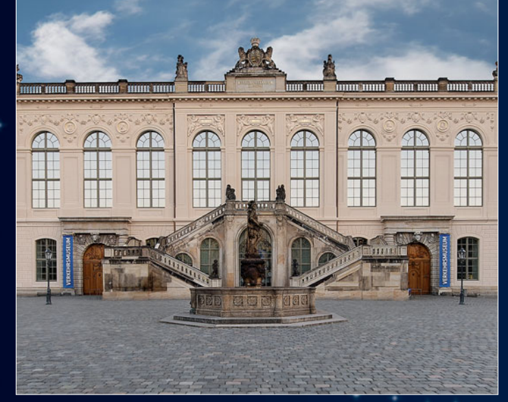
The Transport Museum at Dresden's Neumarkt square