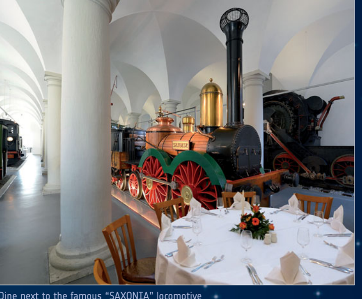
Dine next to the famous "SAXONIA" locomotive